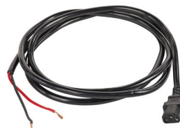
8ft electrical wire cut end included