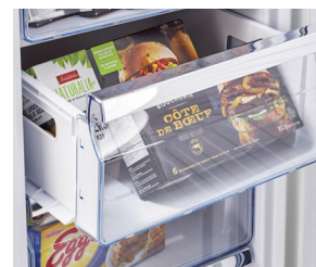
Multiple storage drawers for easy access